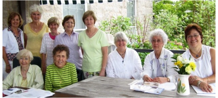
Iota Chapter members met in Stonington in August to plan for the upcoming year.